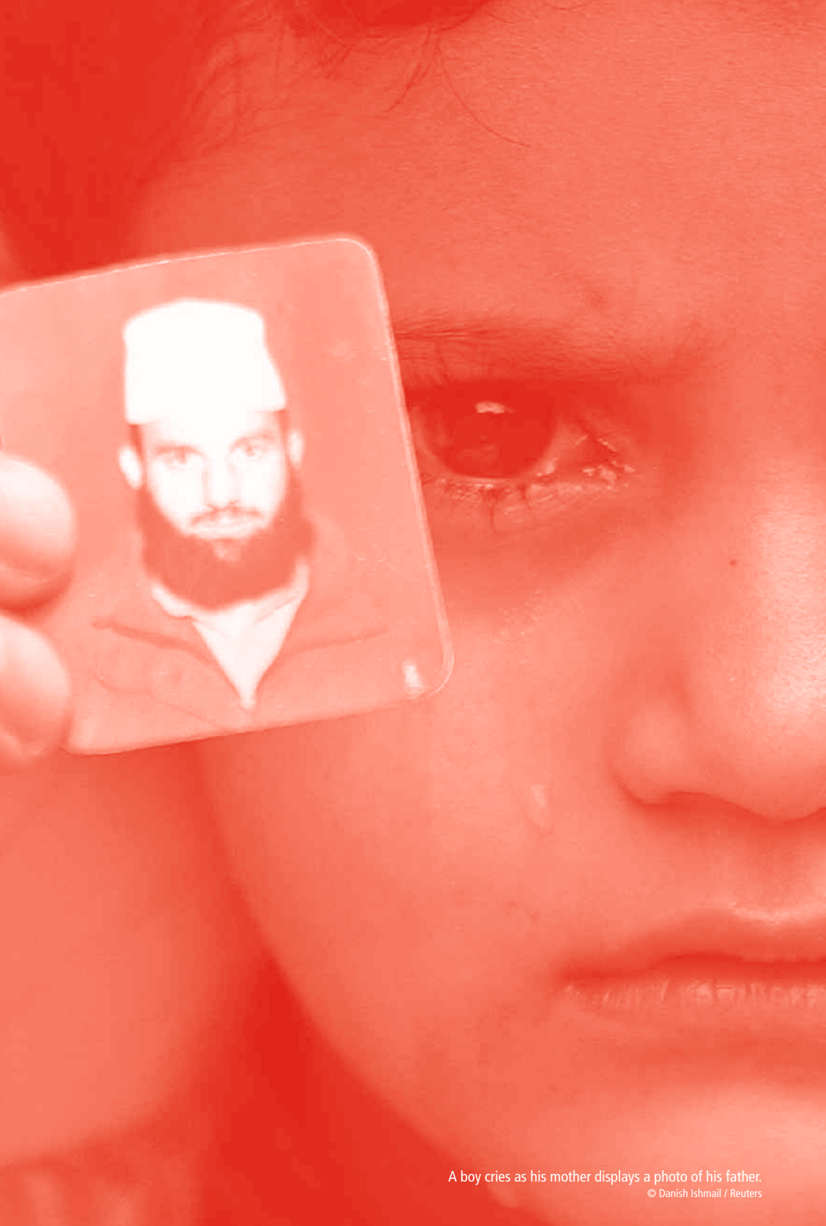
A boy cries as his mother displays a photo of his father.