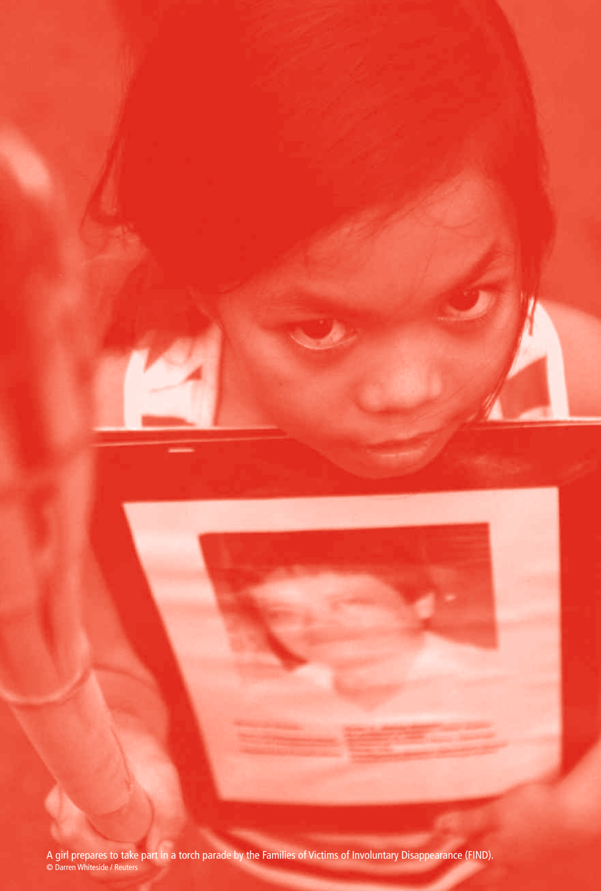
A girl prepares to take part in a torch parade by the Families of Victims of Involuntary Disappearance (FIND).