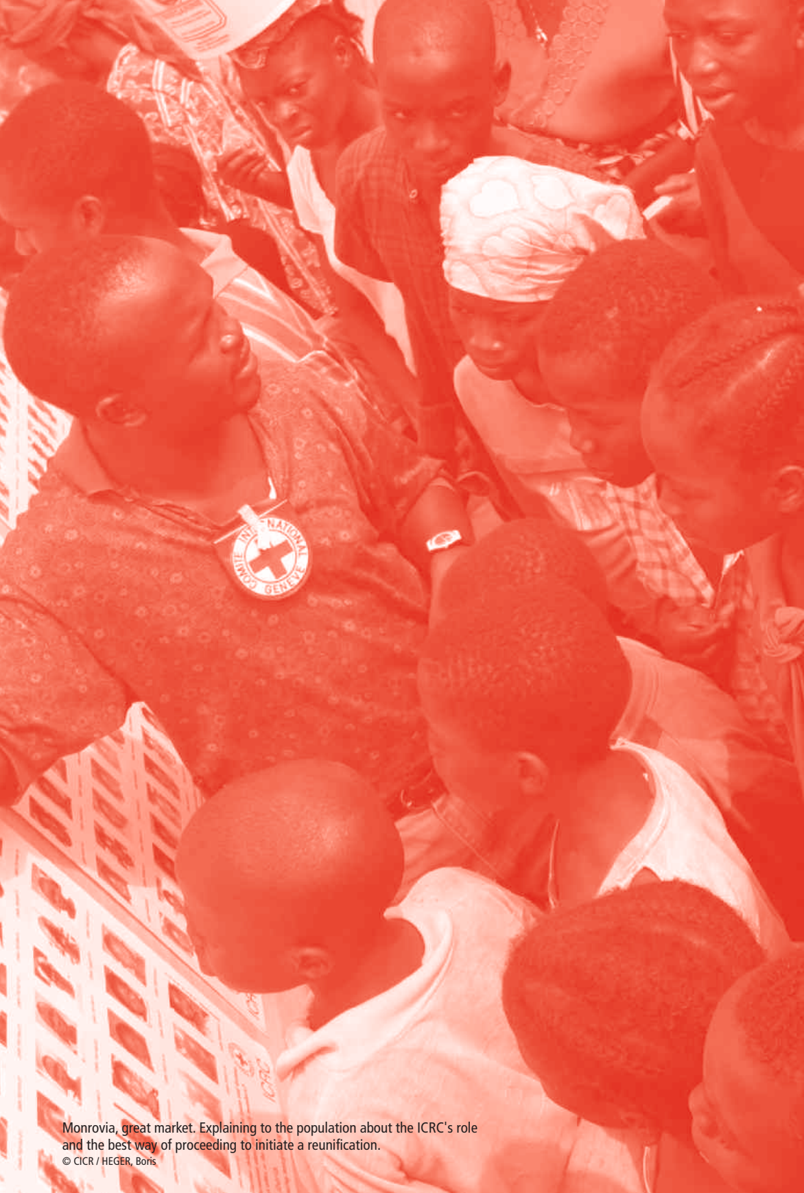
Monrovia, great market. Explaining to the population about the ICRC's role and the best way of proceeding to initiate a reunification.