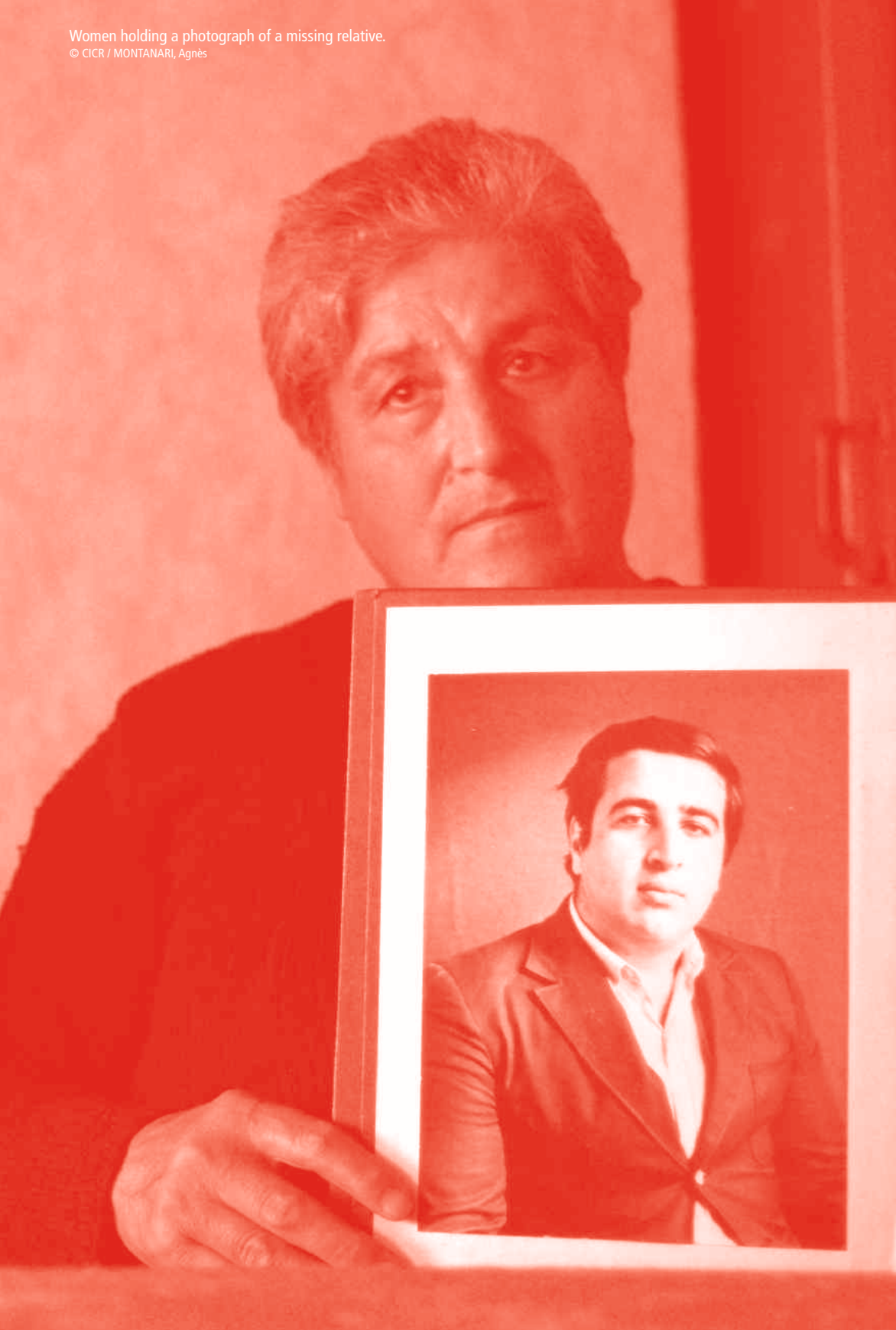
Women holding a photograph of a missing relative.