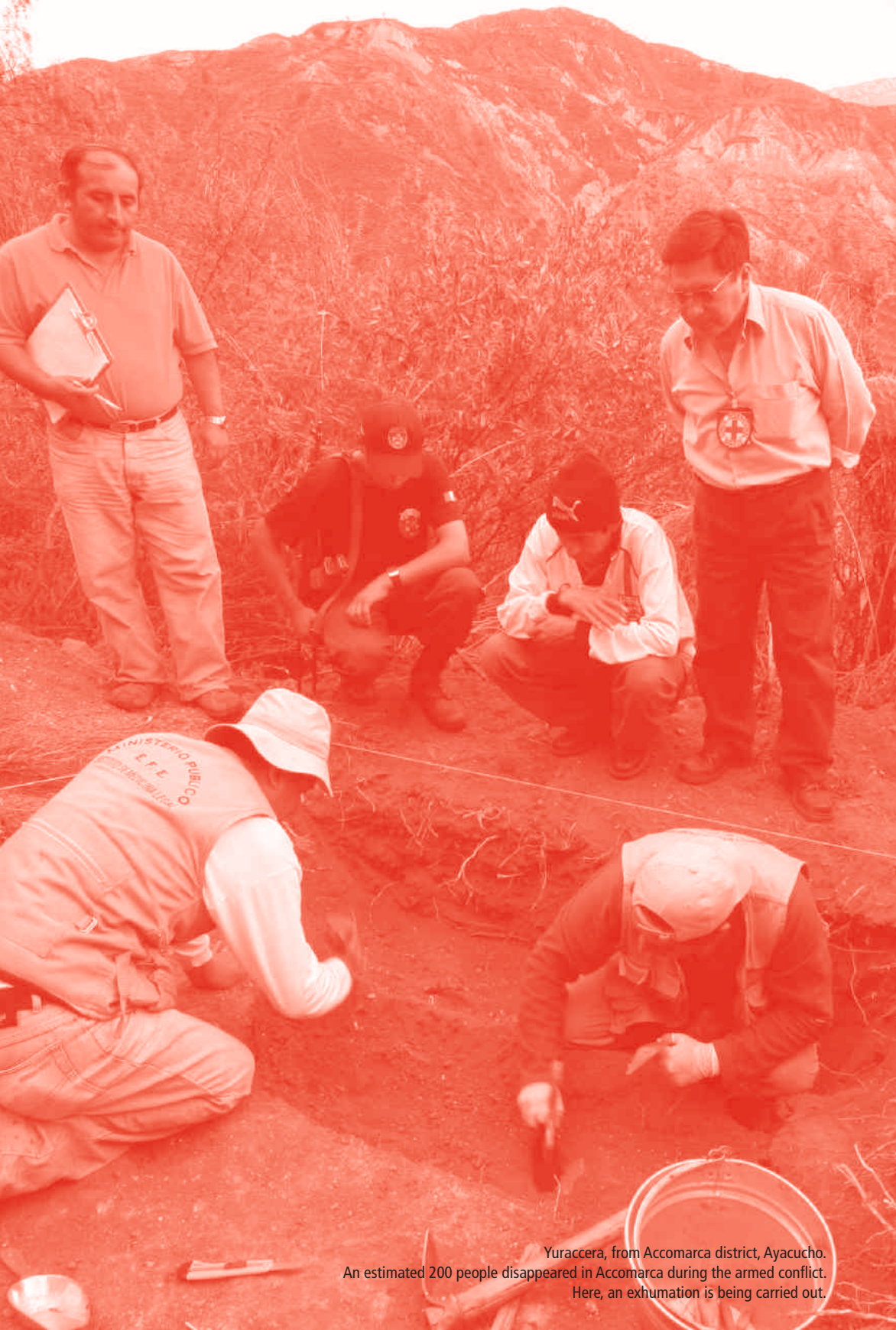
Yuraccera, from Accomarca district, Ayacucho. An estimated 200 people disappeared in Accomarca during the armed conflict. Here, an exhumation is being carried out.