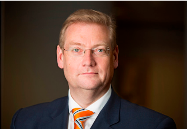
Ard van der Steur